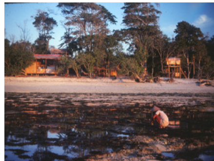
Bill Murray at G-Land, 1980 Code: