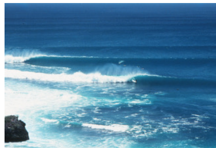
Peter McCabe surfing Padang Code: 41B