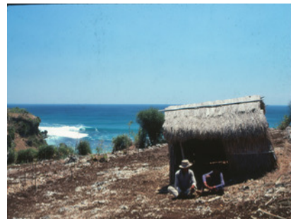
Padang line-up (closer view) Code: 28E